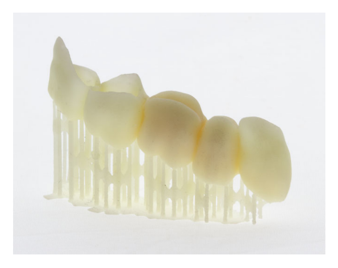
FIGURE 3 Additively manufactured interim dental restoration before the removal of the supportive structures

Different factors, such as laser speed, intensity, angle and building direction, <sup>19–25</sup> number of layers, <sup>21,26</sup> software, <sup>27</sup> shrinkage between layers, <sup>24,26</sup> amount of supportive material, <sup>23</sup> and post-processing procedures, <sup>26</sup> can affect the accuracy (precision and trueness) of the printed object. Because of protocol disparities, technology selected,